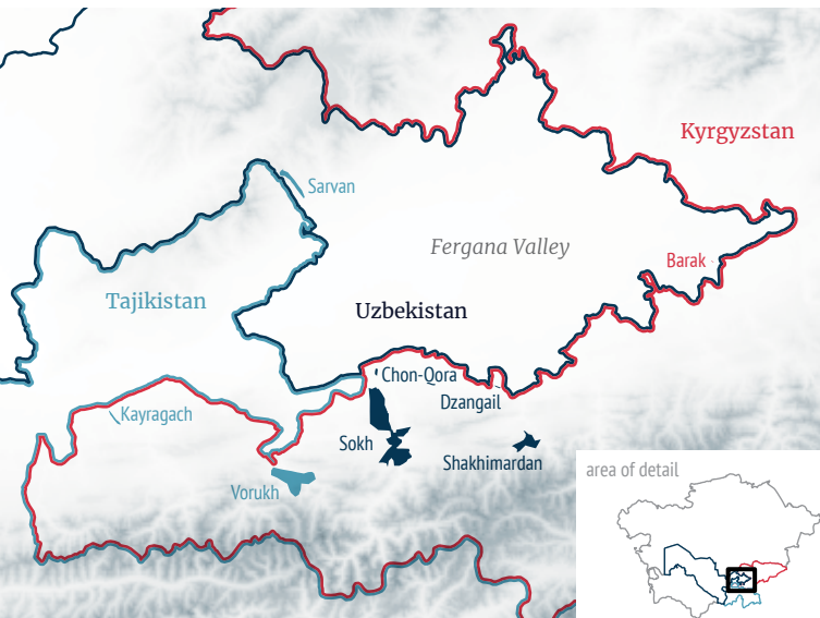
Figure 2: Fergana Valley Including ethnic enclaves

Data: GADM, 2019; UN Office for the Coordination of Humanitarian Affairs; 2013 The boundaries and names shown and the designations used do not imply official endorsement or acceptance by the EU/ISS.